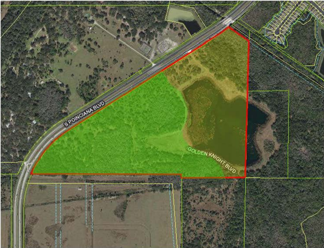
Exhibit A Purchase and Sale Agreement - S. Poinciana Boulevard SUBJECT PROPERTY (GREEN) AERIAL PHOTOGRAPH